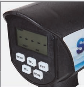
SVR Control Surface