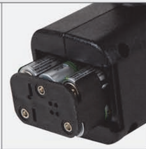
SVR Battery Pack